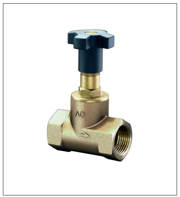
Bronze straight pattern globe valve