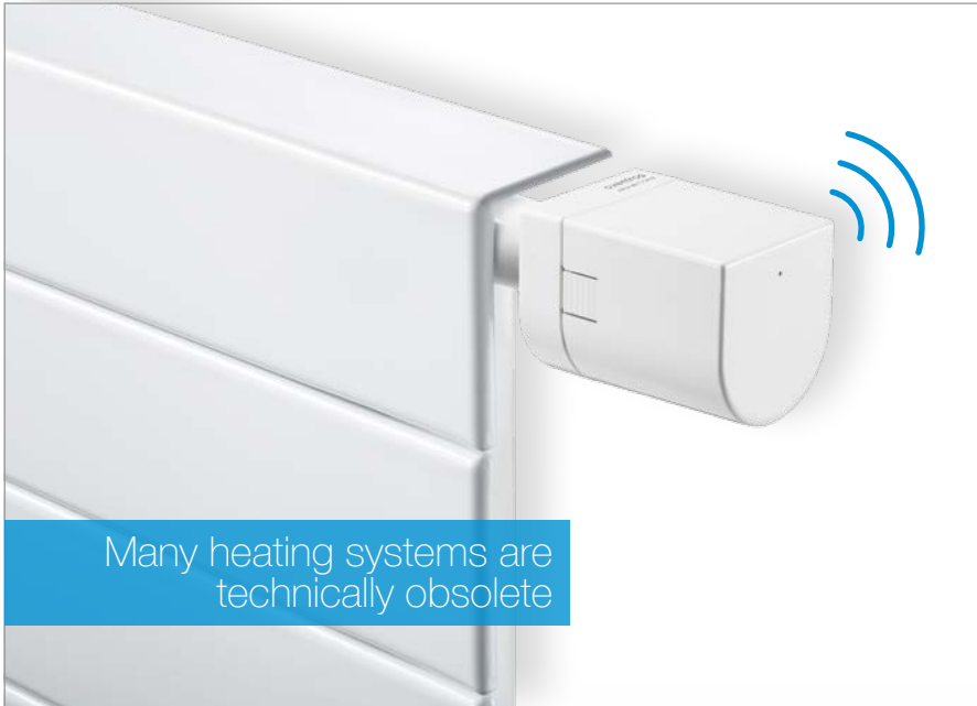
Wireless actuator "mote 420" for smart room temperature control

"Smart Home" eases everyday life and increases the living comfort.