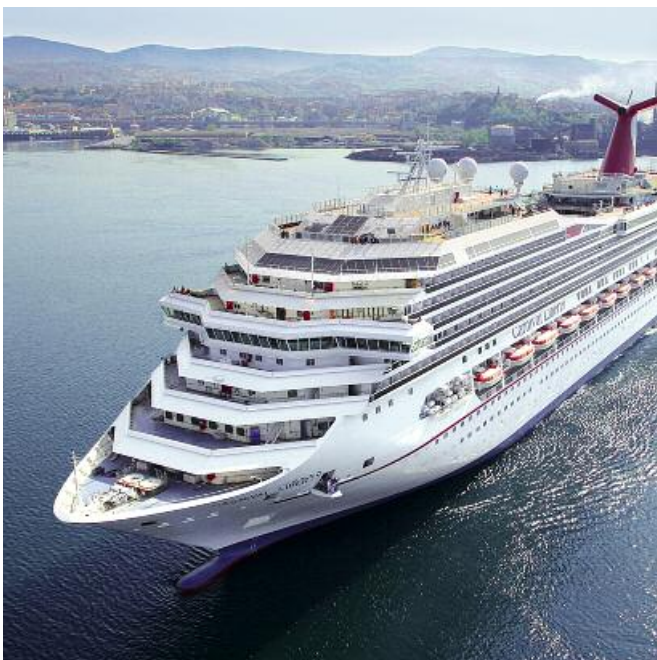
“Carnival Liberty” luxury liner, U.S.A