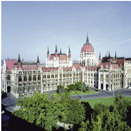
5 "Parliament Buildings", Hungary