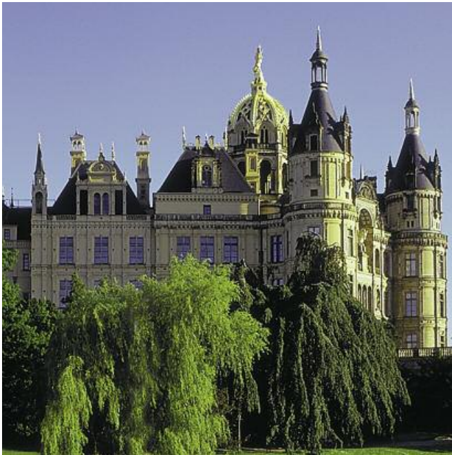
“State Parliament in Schwerin”, Germany