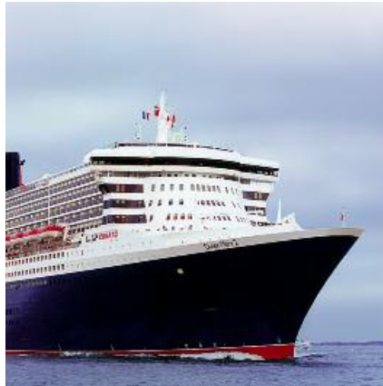
2 "Queen Mary 2", England