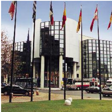
3 "European Parliament", France