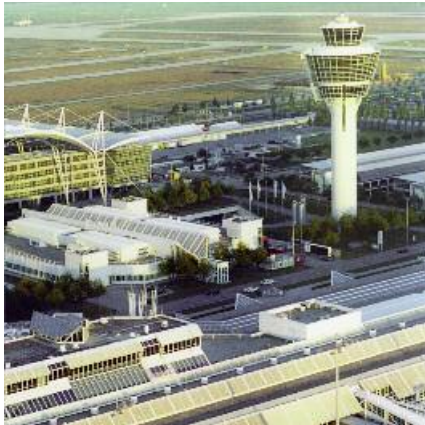
1 "Munich Airport Centre", Germany