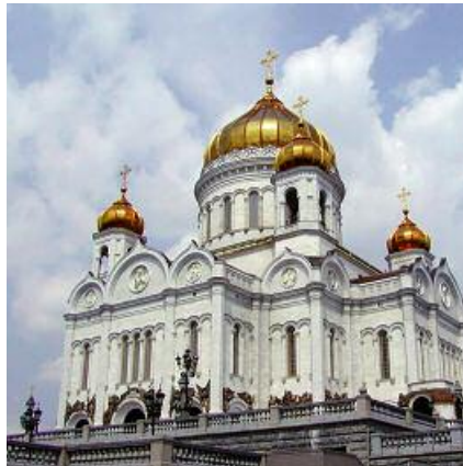
4 "Christ the Saviour Cathedral", Russia