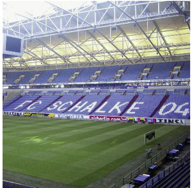
“VELTINS Arena” in Gelsenkirchen, Germany