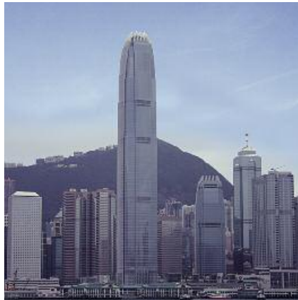
6 "International Finance Centre", China