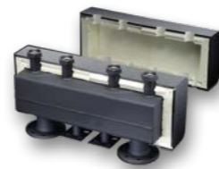
+ HydroFixx hydraulic separator/distributor combination for Regumat DN 40/50