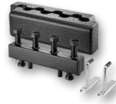
+ Distributor for Regumat DN 25