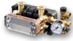
+ Heat exchanger with safety group set