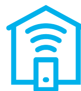
Smart Home, Smart Building

Oventrop is the partner for efficient heating, cooling and clean potable water. The modular systems and services offer pioneering solutions which all HVAC experts use to work with – easily and flexibly – from planning to installation, from industry to trade. As a family business, Oventrop accompanies all its partners over many years - competently and personally.