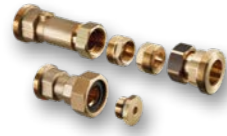
+ Heat meter installation set