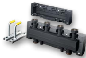
+ HydroFixx hydraulic separator/distributor combination for Regumat DN 25