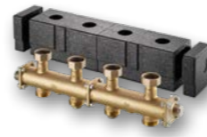
+ Modular distributor for Regumat DN 25