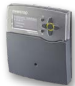
+ Regtronic RH heating circuit controller