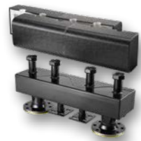
+ Distributor for Regumat DN 40/50