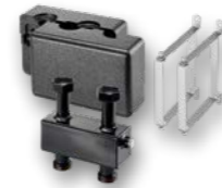
+ MonoFixx for Regumat DN 25