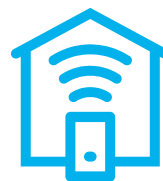
Smart Home, Smart Building

Oventrop is the partner for efficient heating, cooling and clean potable water. The modular systems and services offer pioneering solutions which all HVAC experts use to work with – easily and flexibly – from planning to installation, from industry to trade. As a family business, Oventrop accompanies all its partners over many years – competently and personally.