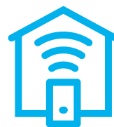
Smart Home, Smart Building

Oventrop is the partner for efficient heating, cooling and clean potable water. The modular systems and services offer pioneering solutions which all HVAC experts use to work with – easily and flexibly – from planning to installation, from industry to trade. As a family business, Oventrop accompanies all its partners over many years – competently and personally.