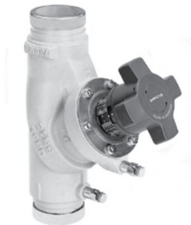
Dimensions in Inches