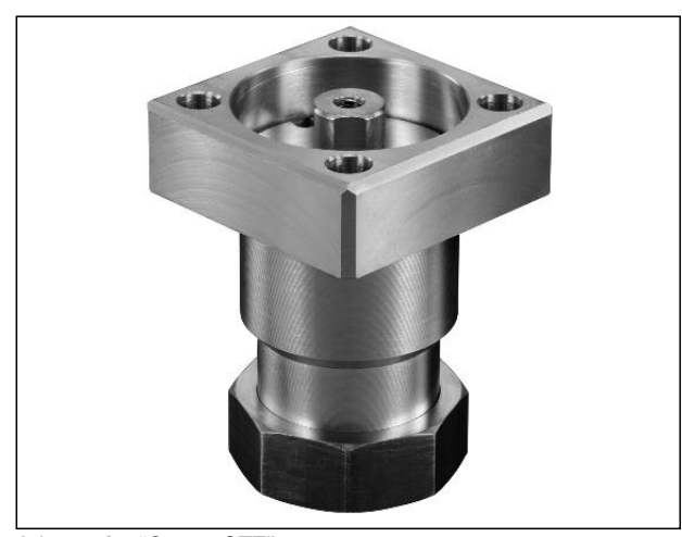
Adapter for "Cocon QTZ"

The Oventrop adapter for "Cocon QTZ" is installed between control valves and rotary actuators. Most rotary actuators feature an angle of rotation of 90°. This adapter converts the 90° rotary movement into an axial piston stroke. Clockwise or anticlockwise rotary movements can be converted into an axial movement. An overstroke limitation protects the components of the adapter against excessive forces which may be caused by an excessive torque and/or the angle of rotation of the actuator. The piston stroke created by the rotary movement is transmitted to the drive stem of the control valve.