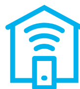
Smart Home, Smart Building

Oventrop is the partner for efficient heating, cooling and clean potable water. The modular systems and services offer pioneering solutions which all HVAC experts use to work with – easily and flexibly – from planning to installation, from industry to trade. As a family business, Oventrop accompanies all its partners over many years – competently and personally.