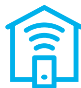
Smart Home, Smart Building

Oventrop is the partner for efficient heating, cooling and clean potable water. The modular systems and services offer pioneering solutions which all HVAC experts use to work with – easily and flexibly – from planning to installation, from industry to trade. As a family business, Oventrop accompanies all its partners over many years – competently and personally.