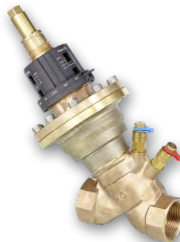
Cocon QTR 1 1/2" to 2" FNPT with female thread