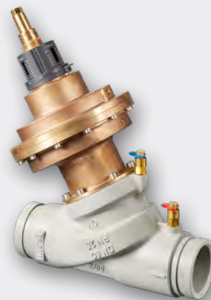
Cocon QGC 2 1/2" to 4" with groove connection