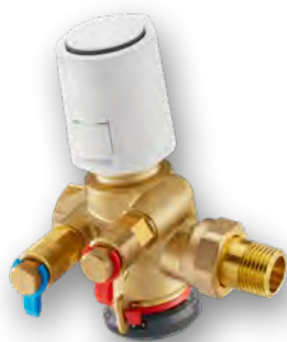
Cocon QTZ 1/2" to 1 1/4" MNPT x FNPT collar nut with MNPT thread tailpiece and female thread