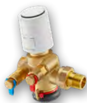
Cocon QTZ 1/2" to 1 1/4" MNPT x FNPT collar nut with MNPT thread tailpiece and female thread