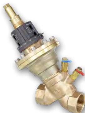
Cocon QTR 1 1/2" to 2" FNPT with female thread