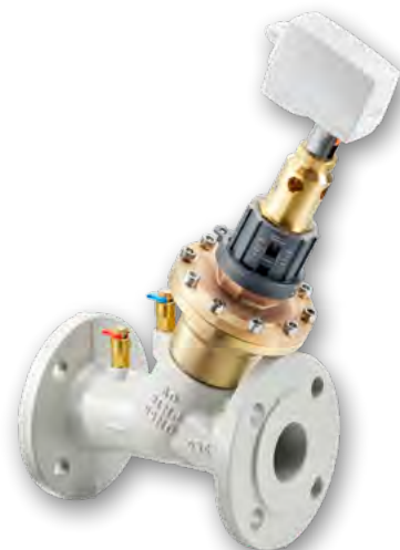
Cocon QFC from 1 1/2" with flanges according to ANSI 150