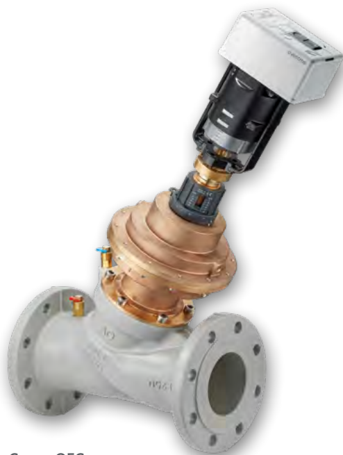
Cocon QFC to 8" with flanges according to ANSI 150

Cocon QTZ in the airport Letisko Milana Bratislava Štefánika in Slovakia: oventrop.com /qr/ref_24