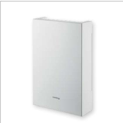
Surface-mounted cover, white lacquered