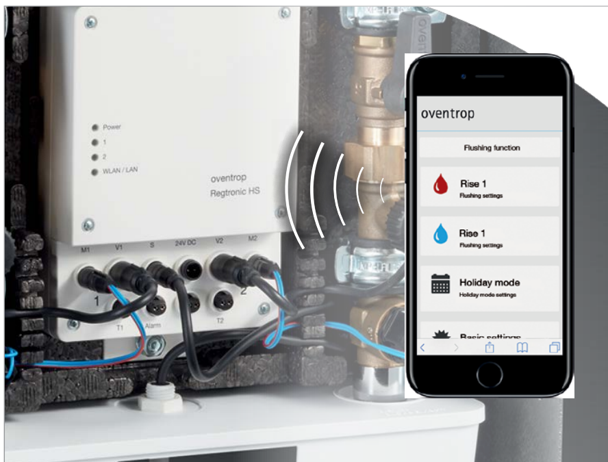
External control of the “Regudrain Duo” flushing station via WLAN