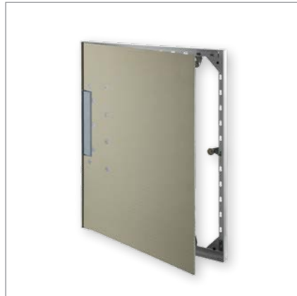
Tiling ready frame