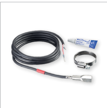
Temperature sensor attached to pipe