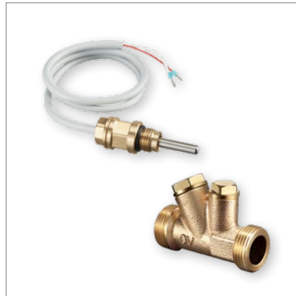
Temperature sensor with “Aquastrom M”