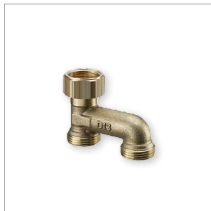
Extension ring circuit